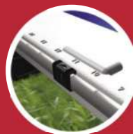
Built-in Score Keeper